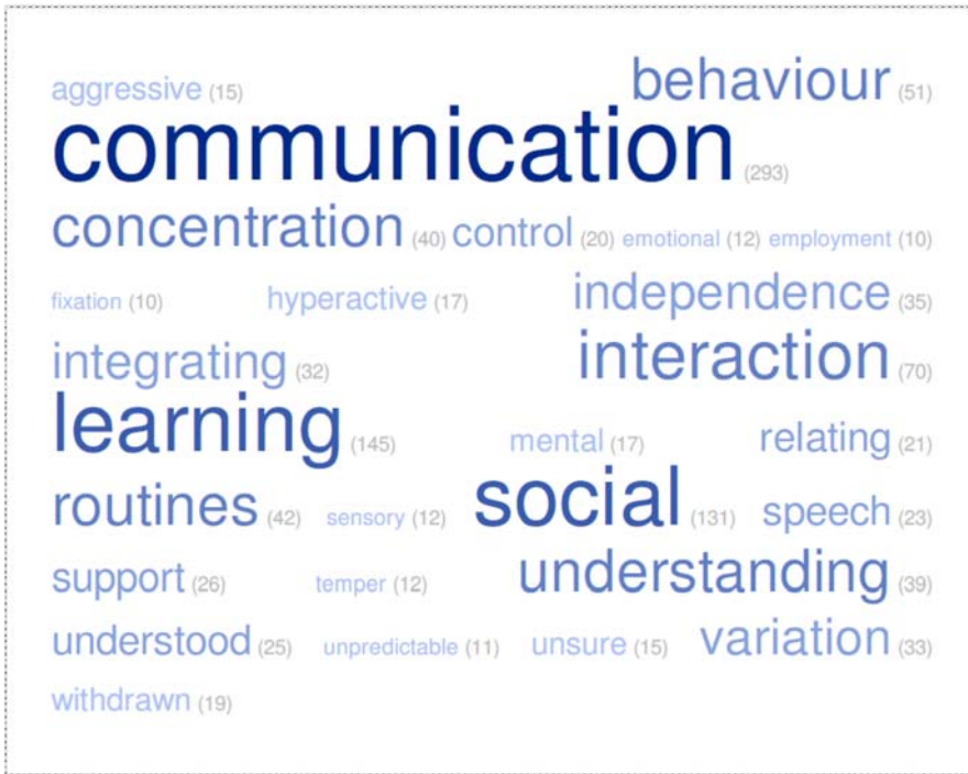
Figure 2: Word Cloud of the challenges which people associate with autism