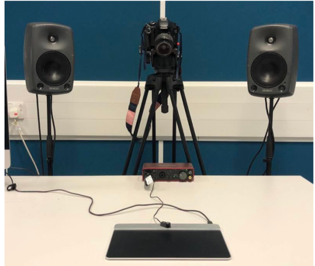
Figure 1. Experimental set-up.

comparable to the physical model in response to input controls, but with reduced timbral features using pink noise. This was done by linking the "pink noise" object in MAX-MSP with an audio-follower, tracking the sound intensity envelope of the physical model, whilst blocking out the other spectral components. This sound condition can be likened to an additive synth hi-hat sound but lacking in physical characteristics and detail compared to the physical model.