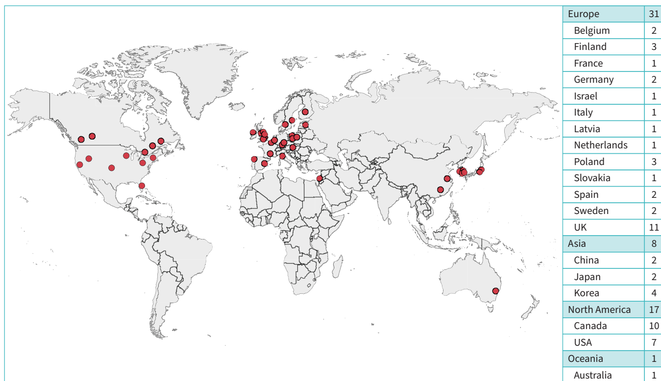
FIGURE 1 Geographical distribution of clinics among 57 panellists from 19 countries.

The panel reached consensus on 15 out of 16 statements, covering the aims, roles and standard procedures of specialist cough clinics. The final consensus statements with level of consensus are presented in table 1 and figure 2, and outstanding remarks for each statement provided in the following text.