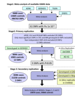
Figure 1. GERAD+ study design.

* Data for rs744373 and rs3818361 in the CHARGE consortium have been presented elsewhere 15 , as has data for rs381861 in the EADI2 samples 4 , as such these SNPs were not included in Stage 3.