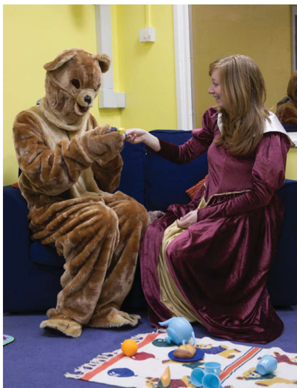
Figure 1 Birthday lady and teddy bear. [Color figure can be viewed at wileyonlinelibrary.com ]