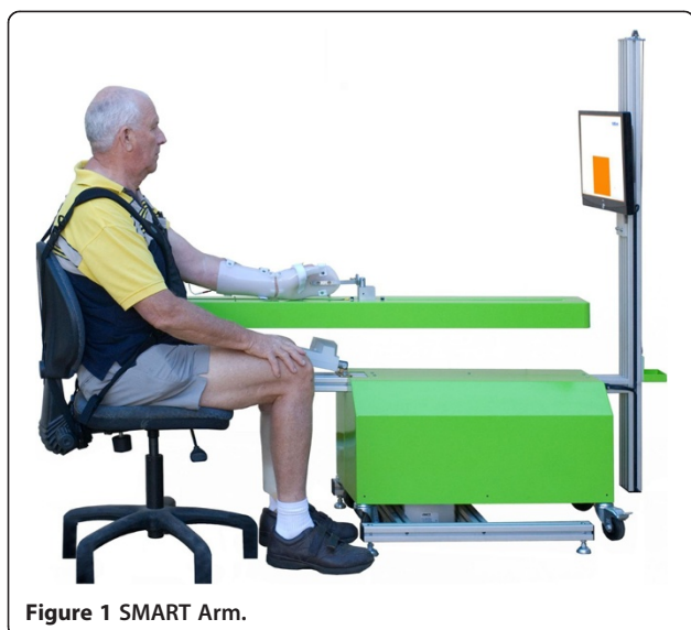
Figure 1 SMART Arm.

A prospective, assessor-blinded, three group parallel RCT will be conducted with 75 stroke survivors with severe upper limb disability who are undertaking inpatient rehabilitation (Figure 2).