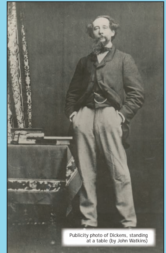
Publicity photo of Dickens, standing at a table