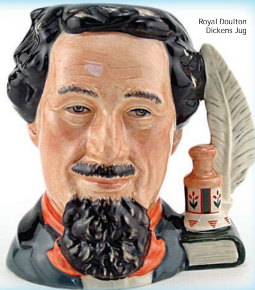
Royal Doulton Dickens Jug