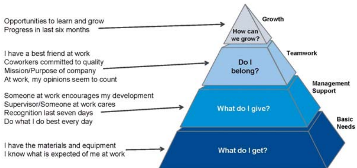
Figure 9.1: Gallup’s Employee Engagement Pyramid

The Gallup Employee Engagement Model is not as comprehensive or in-depth as other employee engagement survey instruments. But Medici is quite happy to use this survey, which it does annually, because it is not too burdensome for employees to complete yet provides the organization with sufficient information to trigger a deeper employment engagement process. Each subsidiary has to go through the same routine. On receiving the survey results for their subsidiary, the senior management team briefs lower management on both the positive and less favourable outcomes. Discussion then occurs on why the subsidiary’s scores on particular questions or themes were lower than expected and what needs to be done to improve the situation. A draft action plan is drawn up, containing proposed measures that should be put in place. After these discussions, line managers are