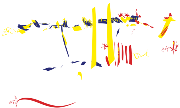
Figure 3. Trio, Page 1 (Rebello, 2010)

CIPHER Series was the first in a sequence of works that share this type of graphical language (Quando eu nasci, and Trio both from 2011). These later works are designed for ensembles and develop the language to reflect a sense of musical parts, which inhabit the same. In Trio a simple colour scheme assigns each performer to a part while all other elements of the score remain non-instructional. Compositional strategies here reveal themselves also in the way the three parts relate to each other. Relationships of accompaniment, continuation, counterpoint, synchronisation can be derived from the score to inform musical performance.