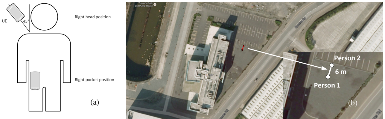
Fig. 1 (a) Illustration of UE positions relative to the human body and (b) plan view of the measurement environment.