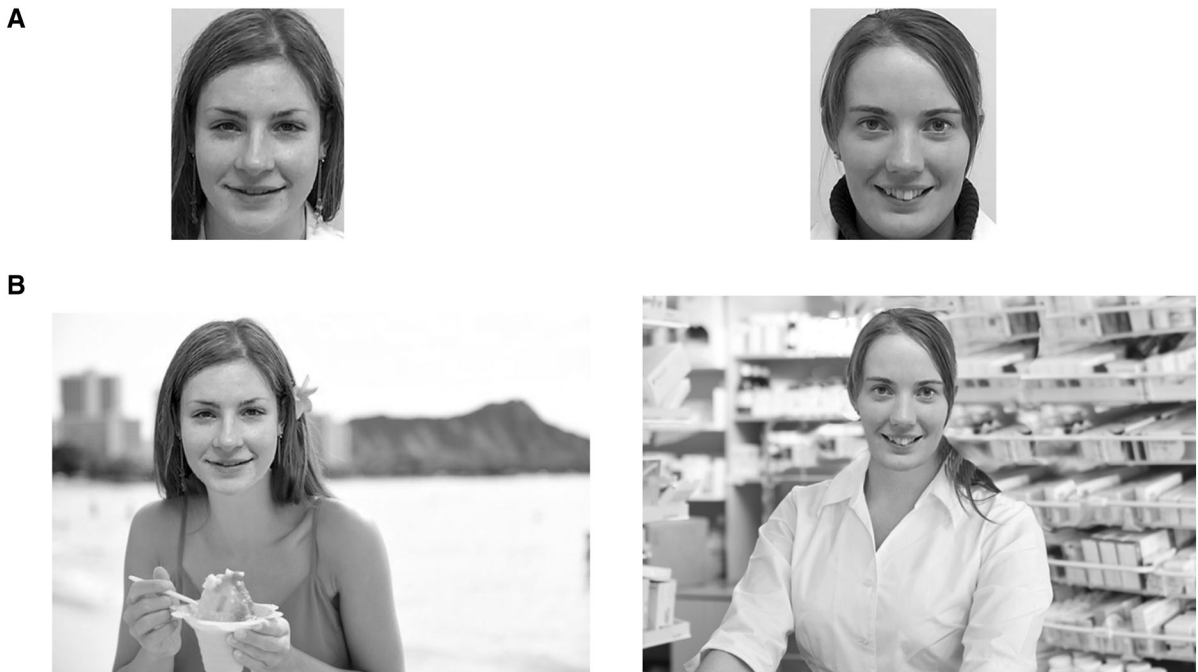
Fig. 1 Examples of face-only (a) and face-context (b) stimuli implying a happy (left) and polite (right) situation in Study 1. All facial expressions represent a posed (non-Duchenne) smile.

the smile would communicate that the person wanted “to be nice and to express positive intentions” or was “feeling happy and content”, using scales ranging from 0 to 100%. Ratings across both response categories were complementary and had to add up to 100%. For the sake of simplicity, we focus in all analyses on the “feeling happy and content” dimension, with higher scores reflecting greater perceived smile genuineness. Participants could take as much time as needed to respond. At the end of the experiment, they indicated their age, gender and ethnicity, were thanked and debriefed.