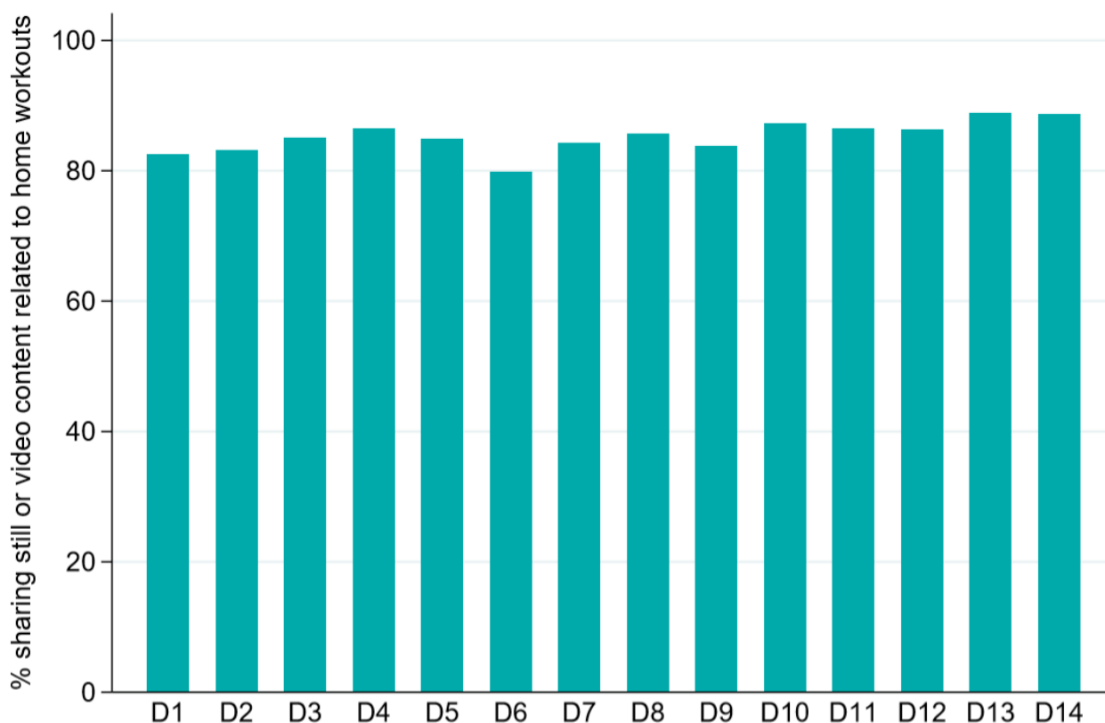
Figure 2. The proportion of participants sharing photos or video content related to home workouts in the intervention group.

The square-root–transformed self-reported anxiety score (main study outcome) fell by -0.23 (95% CI -0.27 to -0.20 ) in the intervention group and rose (worsened) by 0.12 (95% CI 0.09 - 0.16 ) in the controls by the end of the study (Table 1). The change in anxiety score was significantly greater in the intervention group compared to the controls (difference -0.36 , 95% CI -0.63 to -0.08 ; P=.02 ). Significant associations were also found between changes in many SCAS subscale scores and