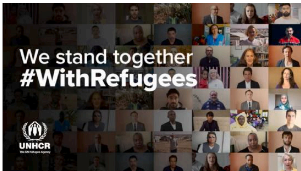
Fig. 1. Behavioral measure of signing a UN petition.

Mplus 7 with full-information maximum likelihood estimation was used which estimates unbiased coefficients assuming data are missing at random. Model fit was assessed using the following guidelines: Tucker Lewis Index (TLI) and comparative fit index (CFI) \geq 0.90 , root mean square residual (RMSEA) and standardized root mean square residual (SRMR) \leq .08 (Hu & Bentler, 1999). For trait empathy, an exploratory factor analysis was conducted. Bootstrapped confidence intervals of the indirect effect were used to estimate