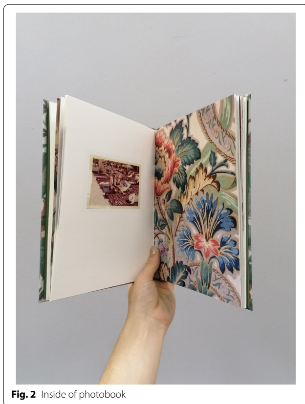
Fig. 2 Inside of photobook