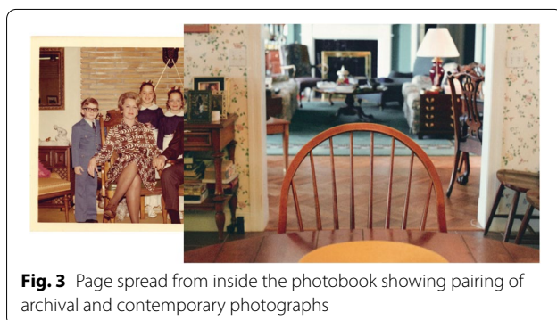
Fig. 3 Page spread from inside the photobook showing pairing of archival and contemporary photographs

to education was based on an asynchronous methodology, with nurses and nursing students reviewing the artist-produced photobook in their own time outside of a formal classroom setting [47].