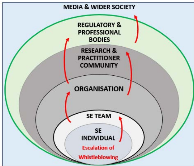
Figure 1: Proposed SE whistleblowing escalation boundary hierarchy based on Anvari et al. [5]

happens (or indeed does not happen). Nor will it factor in advice and support needed by computing professionals and organisations when choosing to take or respond to whistleblowing actions.