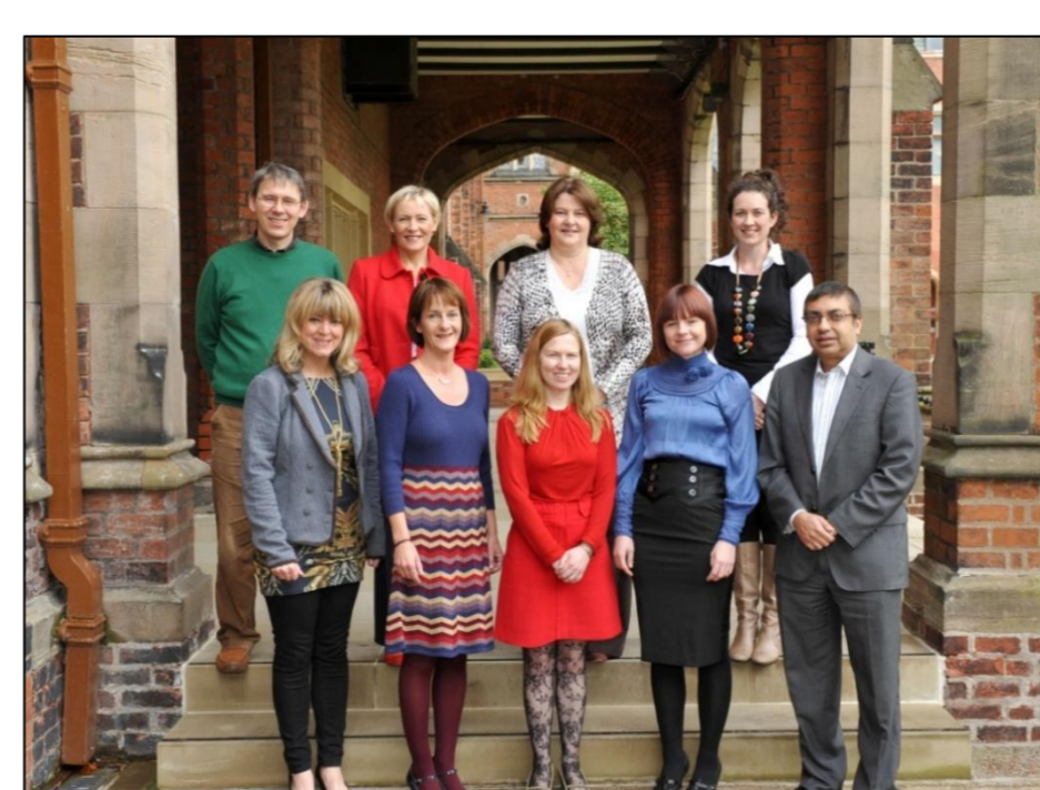
If I Were Jack Project Research Team and Expert Advisory Group

The intervention has been designed to fit within the RSE curricula in Ireland and Northern Ireland by a team of researchers working with experts from the Department of Health, Social Services and Public Safety, the Public Health Agency, the Council for the Curriculum Education and Assessment, the Crisis Pregnancy Programme Ireland and the Department for Education and Skills Ireland and is grounded in our research with teacher trainers, teachers, parents and young people.