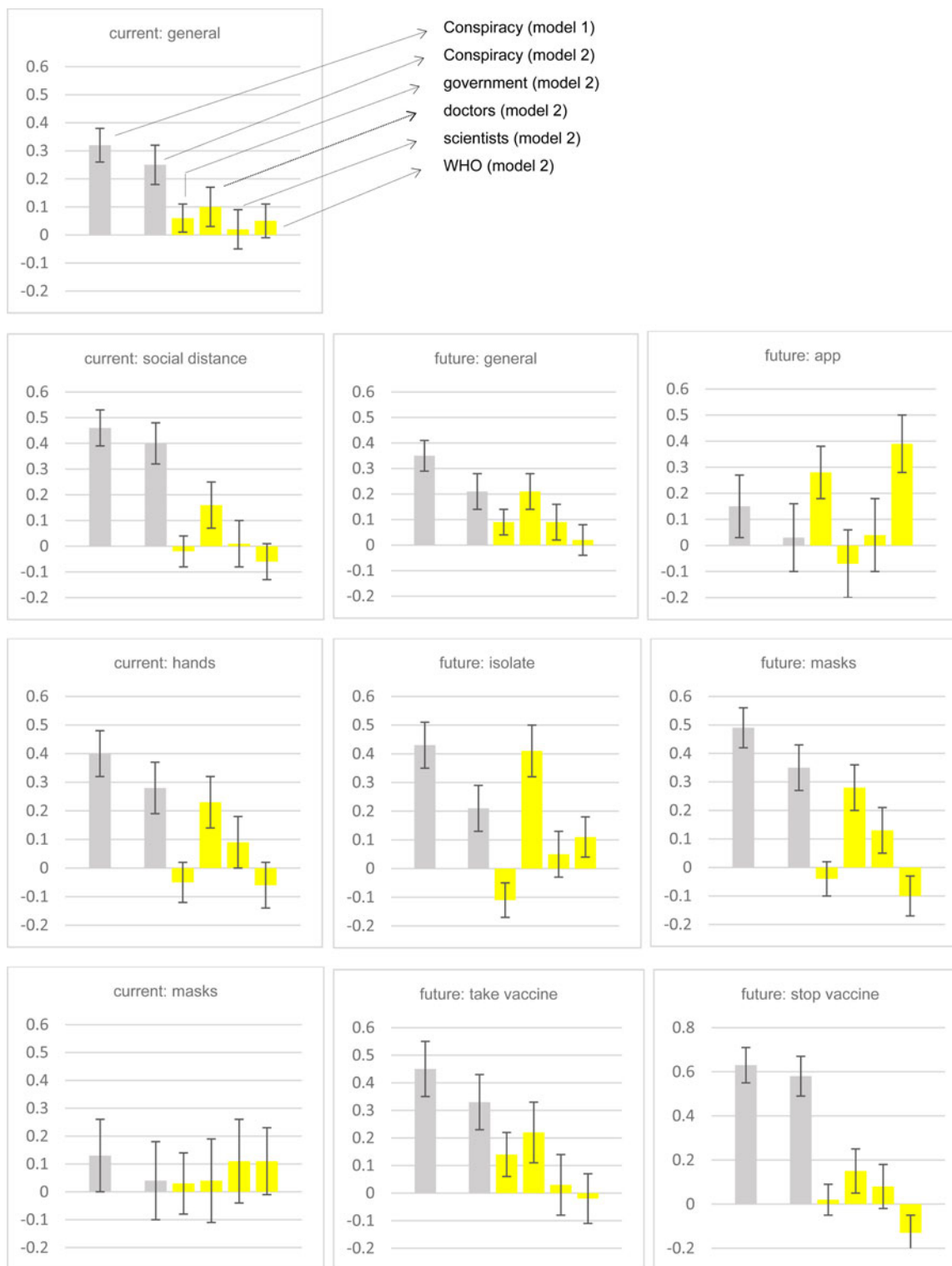
Fig. 3. Effect of pro-conspiracy beliefs on adherence, without (model 1) and with (model 2) distrust variables. Note: all predictor and outcome measures are coded 0-1, co-efficients and 95% confidence intervals reported from OLS regressions (see online Supplementary materials for full details). For some adherence measures (e.g. future: isolate) trust variables reduce conspiracy effect, and not others (e.g. stop vaccine). Partial confirmation of Hypothesis 5.