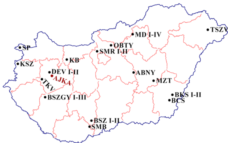
Fig.1 Provenience of the sampling places